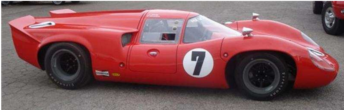
Craig Stacey, Auckland – 1969 Lola SL163/T70 Mk3

Super Historics- Auckland, Craig Stacey has just purchased a big Lola from USA! This car started life as a 1969 Lola SL163 Can-Am Spyder and at some time later it was re-bodied with a Lola T70 Mk3 body. The car will arrive in NZ just before Christmas 2010 and, subject to successful 'acceptance' testing, Craig hopes to race the Lola in the Super Historics class at the Festival.