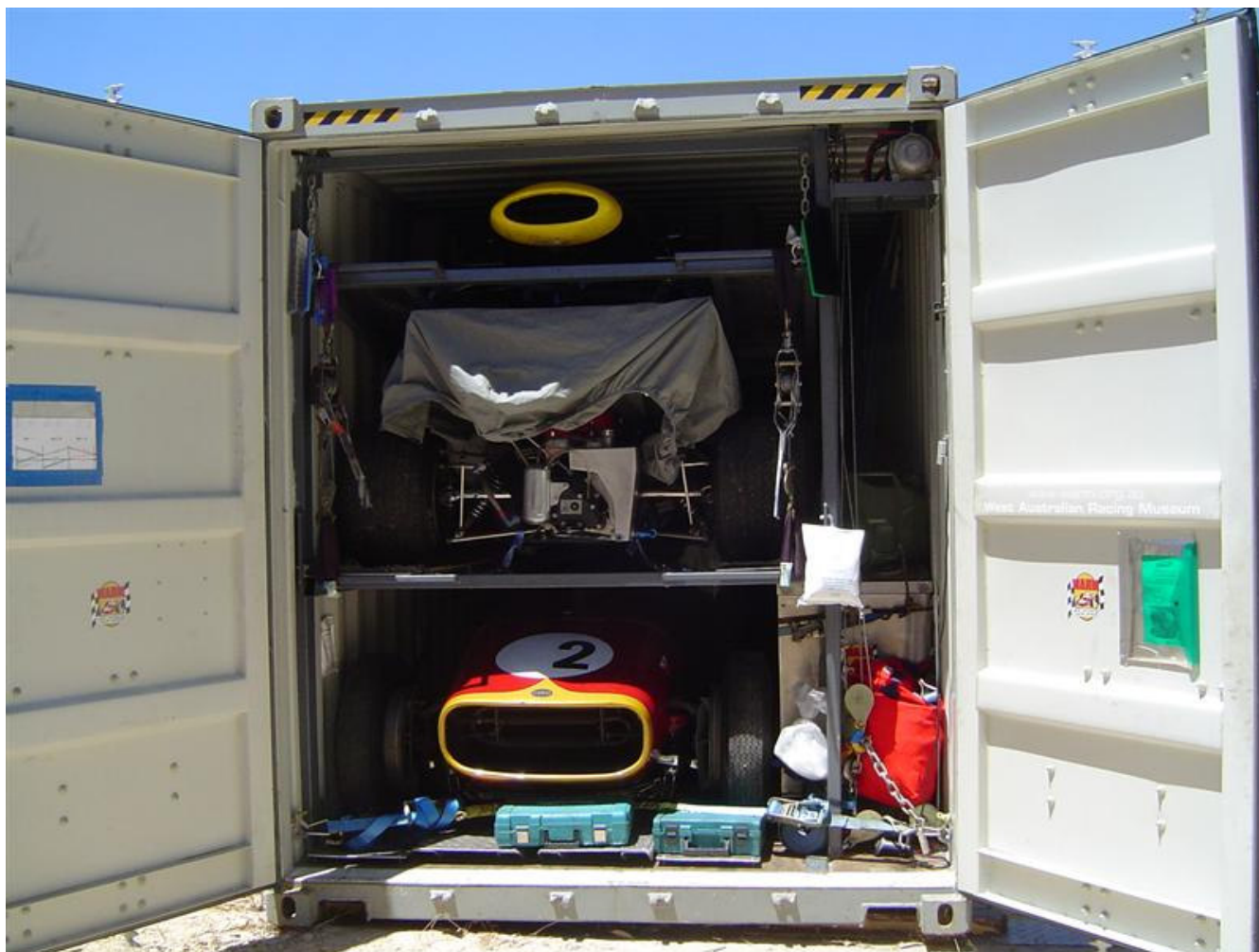
Neil McCrudden's work of art to fit 9 cars into a 40 foot shipping container.

End Piece ! - For those of you who think you can do it all, take a look at the photo below and figure out how Neil McCrudden from Western Australia has fitted 9 race cars into a 40 footer hi-top shipping container. If you can see it, look at the loading diagram on the left hand door for a few clues. A work of art and some very clever engineering. Well done Neil and your team from Western Australia !!