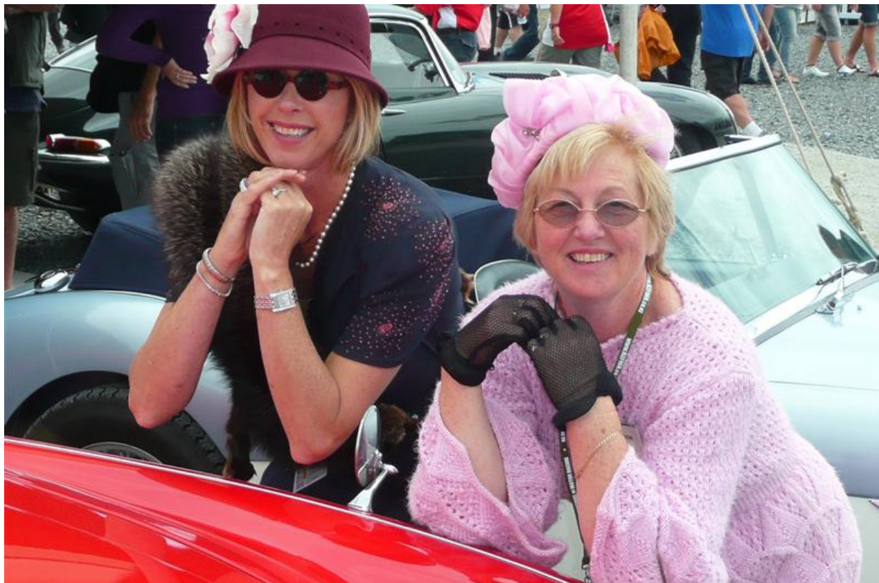
Don't forget to wear your 'period' dress at the NZFMR Chris Amon Festival !!

Period Dress – enter the spirit of the Festival, take the plunge and dress your team and supporters in 'period dress'.