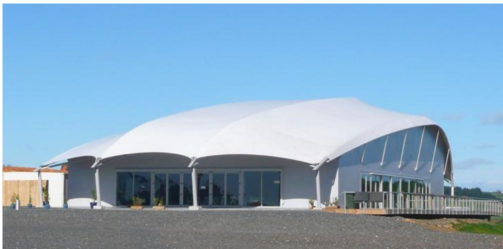
The new Hamptons Convention/Events centre located in the Pit Paddock at Hampton Downs Motorsport Park