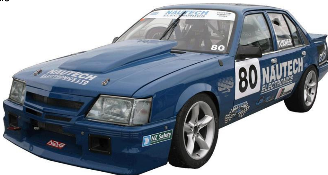
Andrew Turner, Auckland – 1984 Holden VH Commodore 5800cc