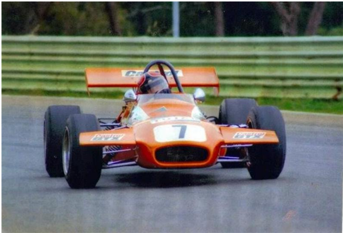
Bruce Hamilton, USA - 1971 Brabham BT30/36-27 Waggott 2000cc – photo of John Harvey (Aus) driving the car in 1971 – (photo source unknown)