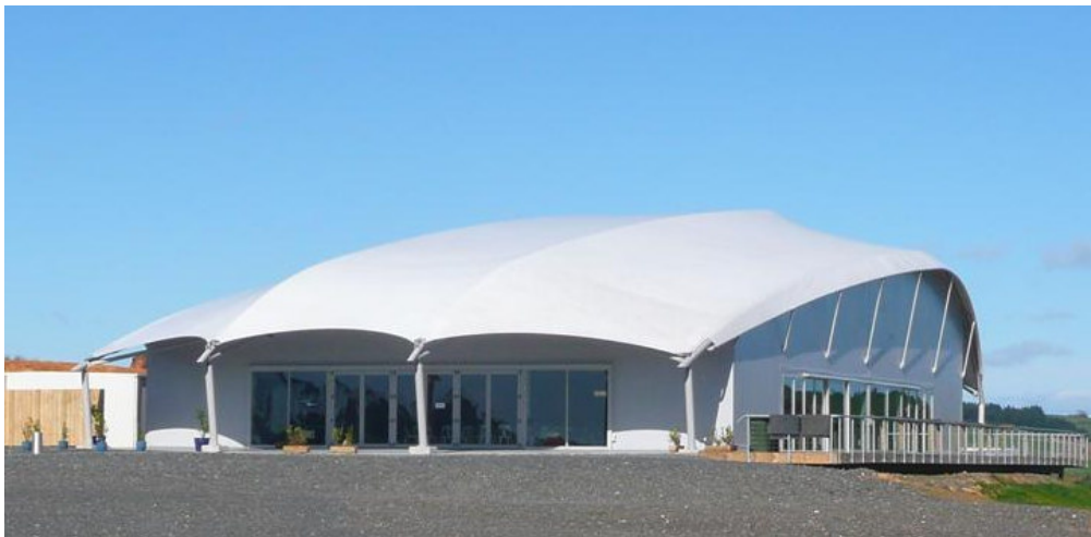
The new Hamptons Convention/Events centre located in the Pit Paddock at Hampton Downs Motorsport Park