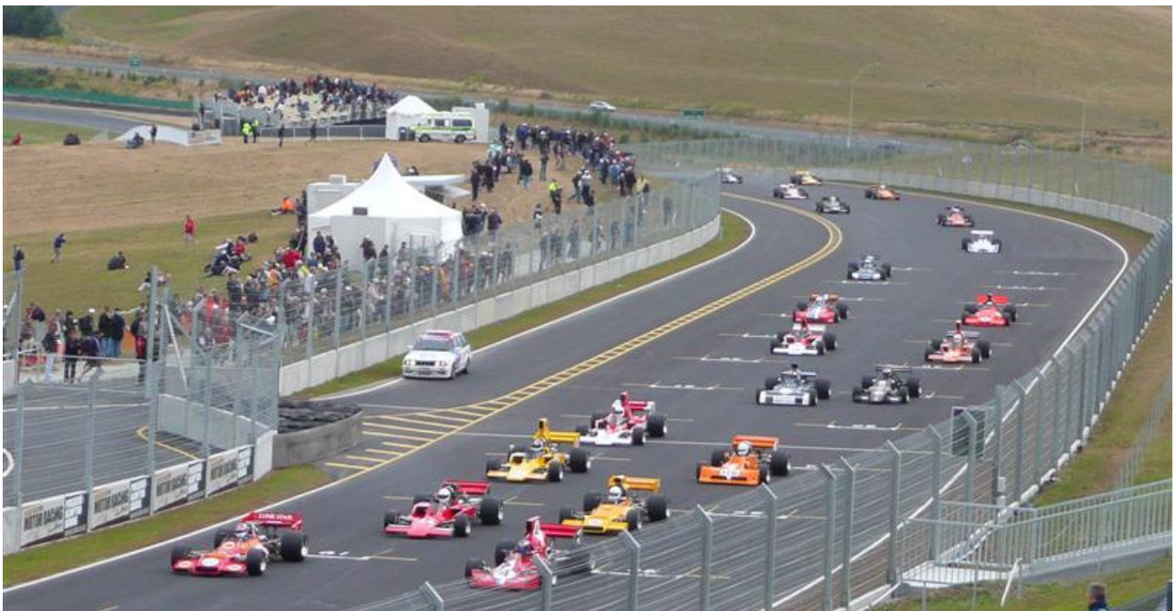
A 'Rolling Start' F5000 race gets underway at the NZ Festival of Motor Racing – Hampton Downs January 2010

We are nearly there - In a little over 3 months from now, the 'NZ Festival of Motor Racing (NZFMR) celebrating Chris Amon' will be held at Hampton Downs Motor Sport Park over two three-day weekends in January 2011. Hampton Downs is located alongside Highway 1, 65 km south of central Auckland, New Zealand, and 60 km north of Hamilton. Check how to find Hampton Downs on their website www.hamptondowns.com